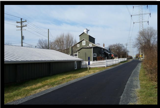
View of the building from the W&OD Trail